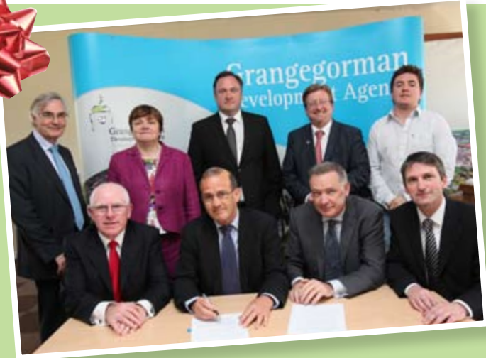
GDA Board members, HSE and Sisk representatives at Contract signing for new hospital

The completion of the An Bord Pleanála hearing in November was a great milestone for the project. However, there were also some setbacks at the end of 2011 as the Government announced it was cutting direct capital funding to the project until at least 2017. On the face of it this seemed as though the project would now be shelved, this is not the case. While the Government will not be providing direct funding it is supporting the Agency in proceeding with the Public Private Partnership element of the project. In addition, other aspects of the project will proceed using philanthropy and DIT resources. Therefore, instead of the planned 70% of DIT students relocating to Grangegorman in 2016, it now looks like 50% will be here in 2017.