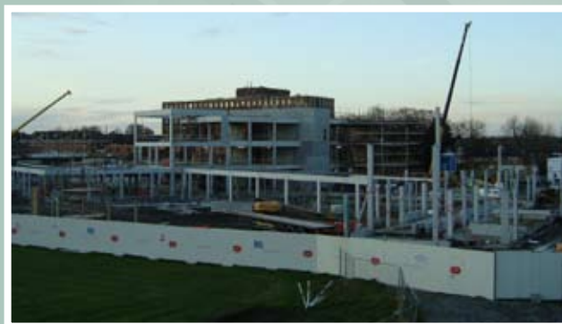
New HSE Mental Health facility

Former President Mary McAleese visited Grangegorman this year