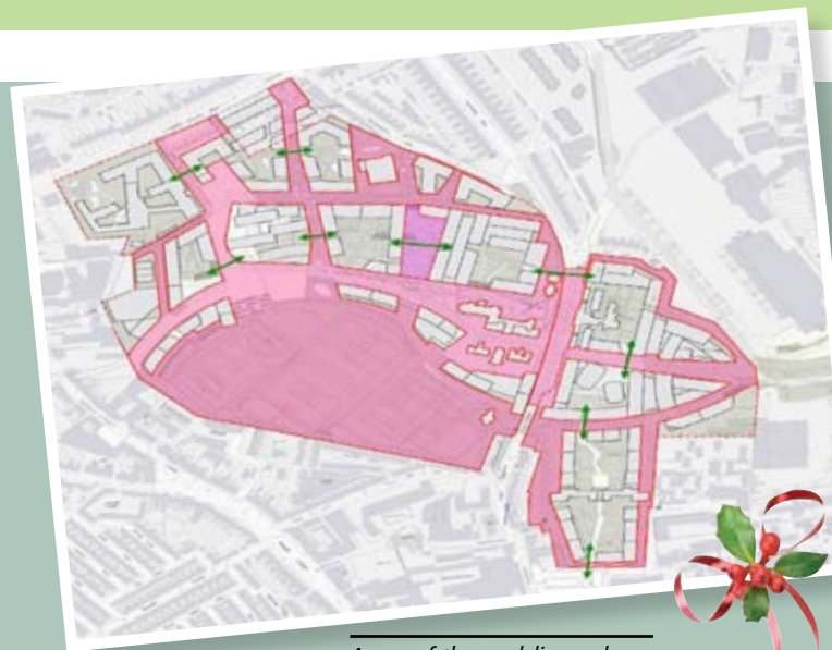
Area of the public realm